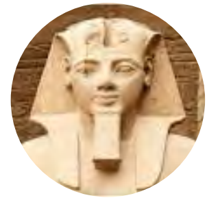
Ancient Egyptians (ca. 1213 B.C.)

Prescribed cannabis tea to treat various illnesses — including gout, rheumatism, malaria, and poor memory