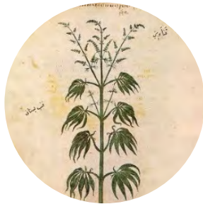
De Materia Medica (On Medical Matters) (ca. 40-90 A.D.)

In the Venidad a volume in the Zend-Avesta lists cannabis as the most important of 10,000 medicinal plants.