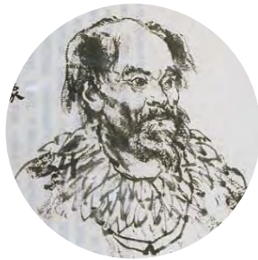
Red Emperor Shen Nung (ca. 2700 B.C.)

Noted that cannabis was very popular medicine that possessed both yin and yang