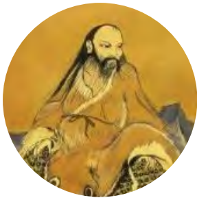
Chinese Emperor Fu Hsi (ca. 2900 B.C.)

Noted that cannabis was very popular medicine that possessed both yin and yang