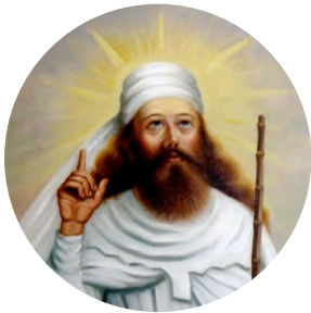
The Zend-Avesta (ca. 700 B.C.)

Prescriptions for cannabis include treatment for eyes, inflammation, and cooling the uterus.