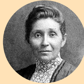
Dr. Susan La Flesche