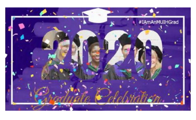
Check out these inspiring stories from some of the 2020 MUIH Grads <u>here</u>!

<u>Check out the</u> <u>Alumni Association</u> <u>Discounts here</u>