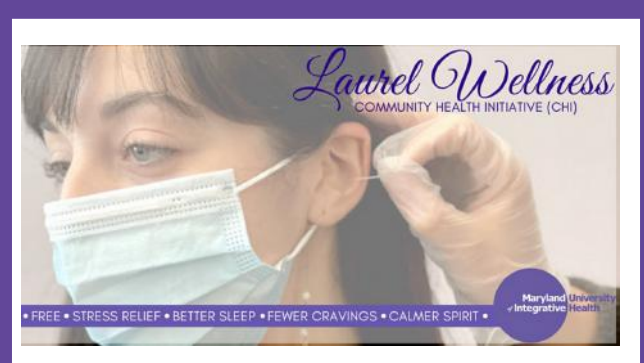
Free Community Acupuncture is now in operation at MUIH. Walk-ins are not currently allowed. Sign up <u>here</u>.

<u>Maryland University of Integrative Health</u> <u>supports A Wider Circle's Race to End</u> <u>Poverty</u>